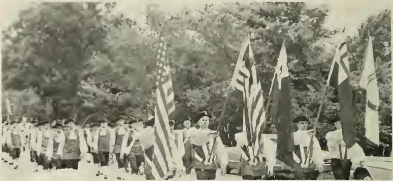
Marching Unit The Chelmsford Colonial Minutemen

Scenes of the July 4th, 1968 Parade a highly successful event, an example of what can be accomplished when town residents work together.