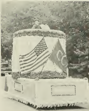
Float depicting BROTHERHOOD