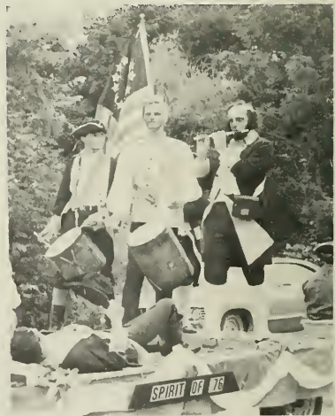
Float depicting the SPIRIT OF '76