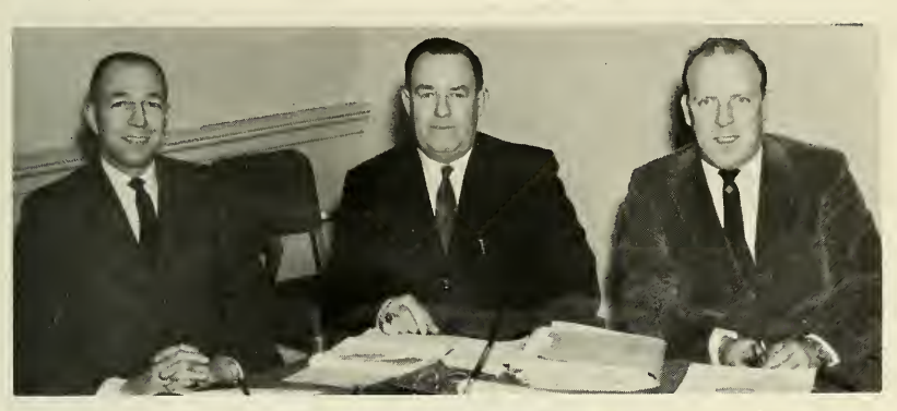
BOARD OF SELECTMEN